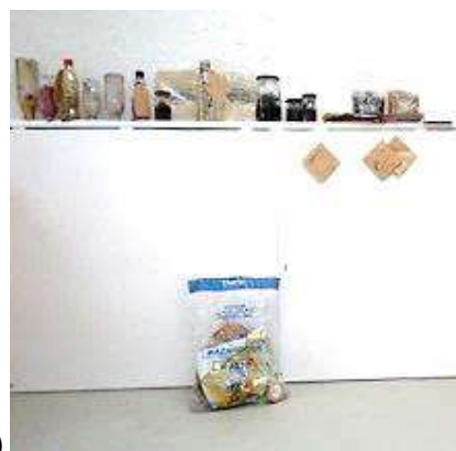
Bess Frimodig: Earth as Skin (Estesio, courtesy of the artists)