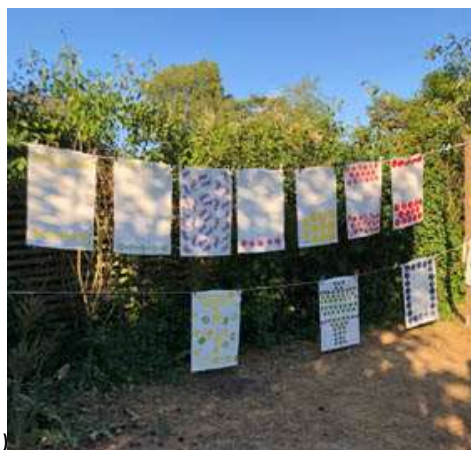
Collective outcome Workshop (Anne-Marie Mohlin)

There is also a cultural aspect: today we can enjoy food from all over the world... it is enough to download an app and decide. We can eat the food, but rarely we take the time to learn about the origin of the food.