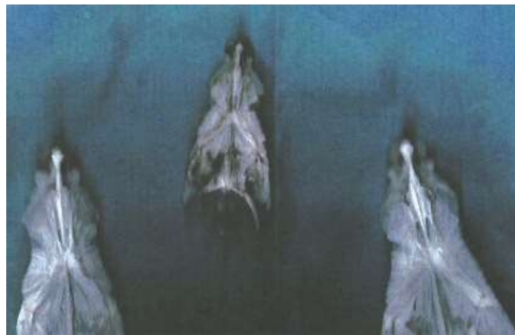
Sammy Rimington Lost souls photo montage (Estesio, courtesy of the artist)

- I am touched by their immediate responses. The Sea connects us in so many ways.